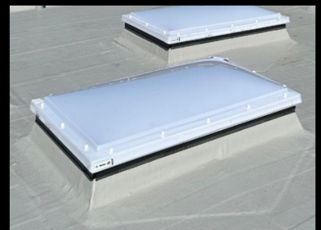
After- New Rooflights

T: 0845 899 4444 E: sales@makers.biz W: www.makers.biz